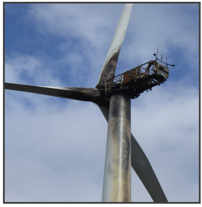
Wind Turbine Failure, U.K.

We provide Engineering Consulting Services and Support to the Insurance and Legal Industries on matters relating to all types of power generation, construction, heavy industry and maintenance facilities, and act as Expert Witness in Arbitrations and Legal Proceedings.