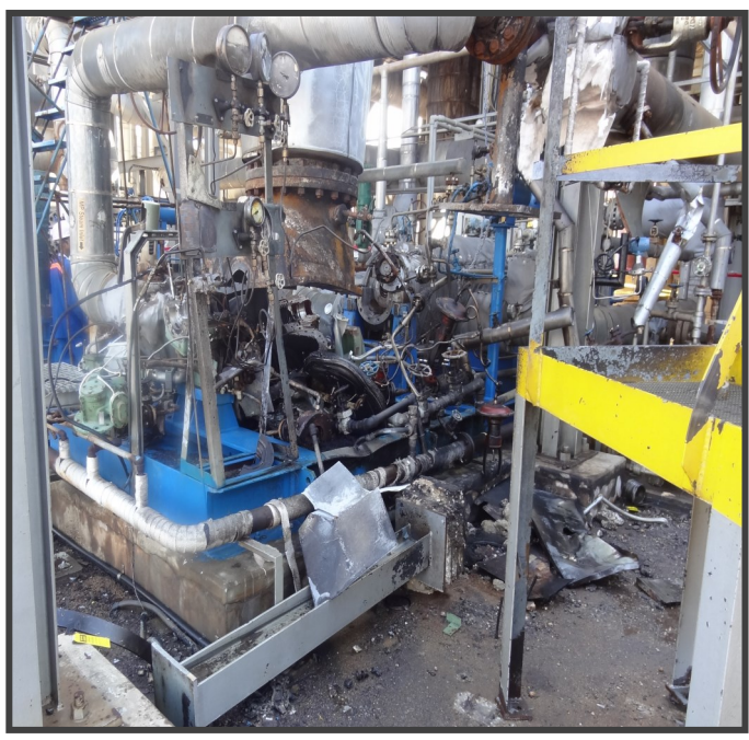
Turbine Failure, Trinidad