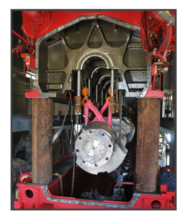
Crank Shaft Removal from Large Diesel Engine, Caribbean

Expertise in all aspects of Project Development, includingConceptual Engineering and Costing, Contracting, EngineeringDesign, Procurement, Construction, Start-up, Testing,Commissioning and Placement into commercial operation.I have conducted numerous investigations in foreign countriesand adapt easily to local conditions and customs.